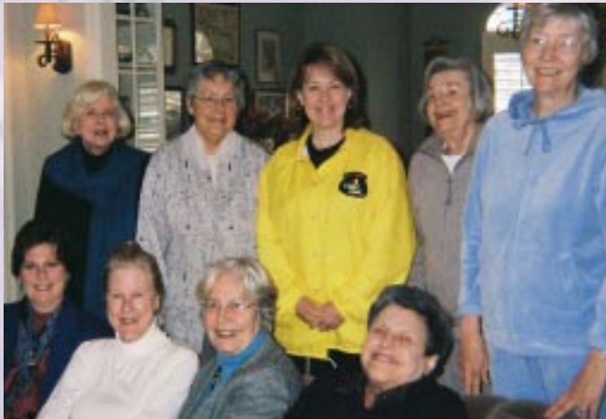
Annual Meeting Awards Committee

Please see Registration Form insert for details.